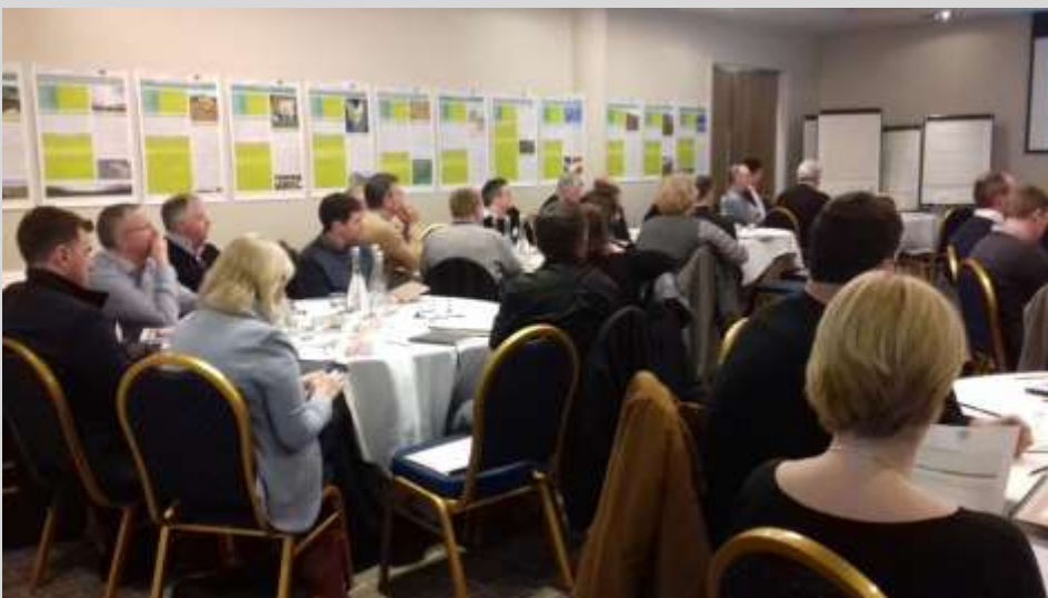
National Rural Network European Innovative Projects EIP, event in Portlaoise

2018 promises to be an exciting year for the NRN as the NSU disseminates information and updates from the successfully selected EIP-AGRI Operational Groups via a dedicated Story Board on our website. The NSU will also deliver key messages regarding Ireland's Operational Groups to an EU audience as opportunities become available at workshops and seminars in EU member states. As more projects receive funding through the LEADER Programme, the NRN will add them to the storyboard on its website highlighting their impact.