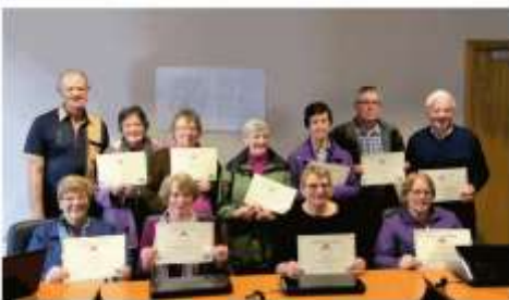
Getting Citizens Online class in Athlone receiving their Certificates

Irish Rural Link continued to run Free Basic Computer Classes through the Getting Citizens Online Programme in 2017 and in May launched IT Skills for Farmers to provide basic digital skills training to people in the community that have never used a computer before. Getting Citizens Online Programme is a continuation of the BenefIT4 programme which IRL ran for 3 years and trained over 4,500 citizens. These computer courses are free and took place at a range of venues around the country and on the Islands. The main objective is to get more people online and be able to send an email, Skype with friends and family around the world, while the IT Skills for Farmers covers Farmer Registration, Calf and Herd Registration, Computer Literacy, Compliance Certs, Internet Search, Revenue and other Government websites and banking online. Classes are free and take place over a 5-week period with 2 hour classes per week. Training is provided by fully qualified Computer Tutors. In 2017 IRL have trained 1600 people on both Citizens on Line and IT Skills for farmers.