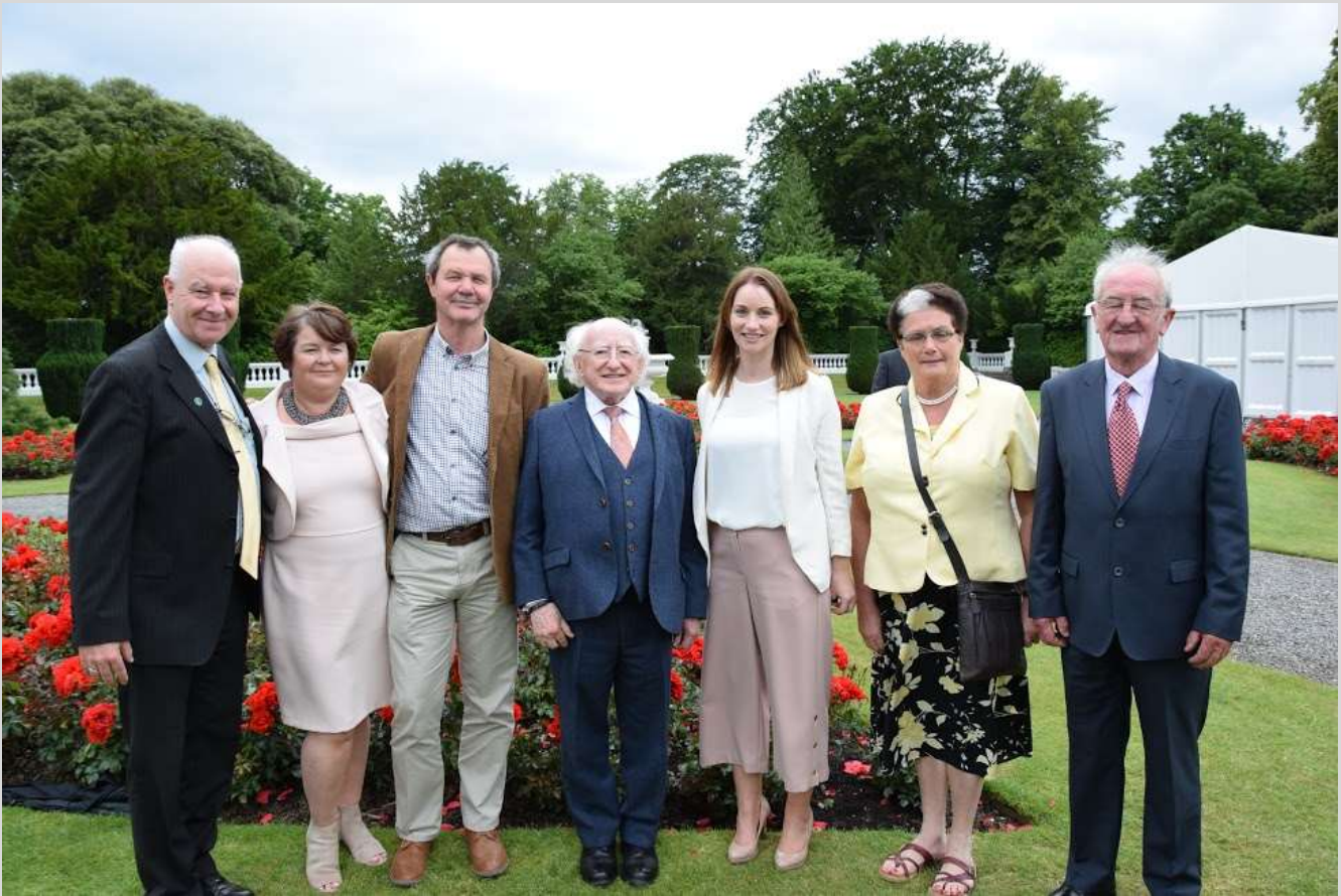
Board and Staff with President Michael D. Higgins at the Garden Party for Community Groups