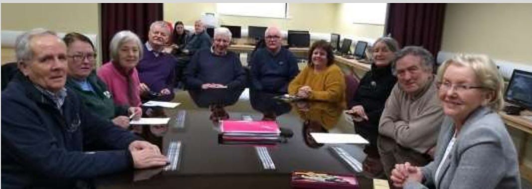
Getting Citizens Online class in Athlone

As well as being involved in Social Partnership IRL represents rural interests on a wide range of external bodies and Boards. In 2017 IRL continued working with; The German bank Sparkassenstiftung on the Rural Banking project, with 6 EU partners on the MICRO (Erasmus+) project, our three Irish Partners on the National Rural Network, and our Northern Ireland partners on the Politics Plus programme (Horizon). IRL sits on fourteen National Committees; continues as Chair of Pobal, and the National Peatlands Council, and is a member of the EU Social Economic Committee.