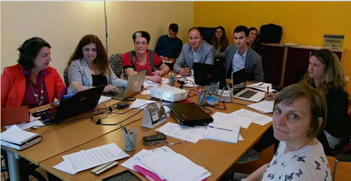
Partners meeting in Pescara, Italy. April 2017

The training modules were distributed among the seven partners to design according to general parameters that have been informed by the survey responses from micro-enterprises. IRL worked with NUIM to work on three subject areas that take advantage of our different skillsets and experience. The three areas that NUIM and IRL contributed to were: